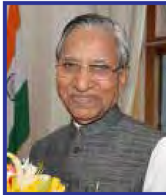
H E Shri. Ganga Prasad Hon'ble Governor of Sikkim